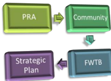
Figure 4. Research Method

The formulation of this strategic plan involves an active cross-sectoral role from the administrators of the Disaster Resilient Women forum, the Cikole Village government, the Lembang District's 14 BD, and the West Java FPRB ( Forum Penanggulangan Resiko Bencana/Disaster Risk Management Forum ). Multi-stakeholder involvement can have a positive impact in handling disaster mitigation (Jiang & Ritchie, 2017).