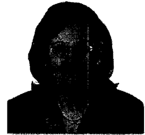
Vice Rector for Academic & Students Affairs Universitas Widyatama