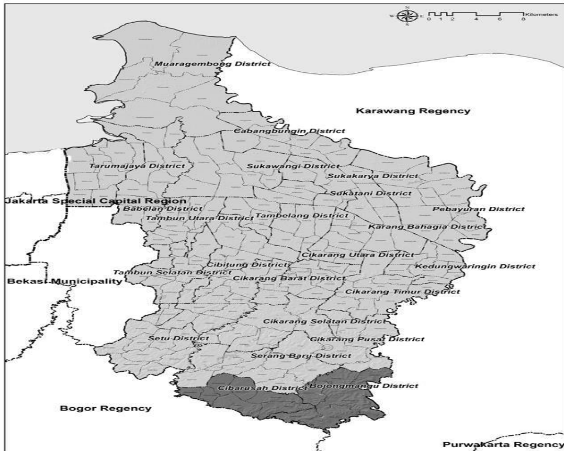
Figure2. The position of Cibarusah District and Bojongmangu District in Bekasi Regency