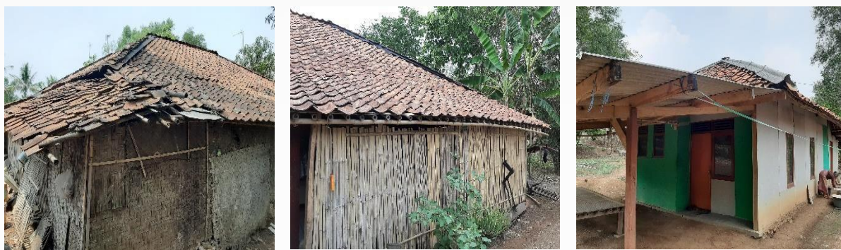
Figure 3. House Condition in The Study Location

The study findings show the roofs of houses in the study area as shown in Figure 3 . The volume of rainwater captured depends on the area of the catchment area. The catchment area used in the harvesting of household rainwater is the roof of the house. The roof of the house in the survey location varies, if you pay attention to the type of roof being observed, the area of the catchment used in the calculation is half (0.5 times) of the total roof area. In the following table it shows the area of the roof and the area of the observed rainwater catchment. The average rainwater catchment area for Bojongmangu and Cibusah Districts is presented in table 1 .